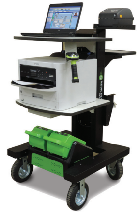
FH Series shown with optional accessories

The FH Series Mobile Field Health Workstation was designed to accommodate mobile printing for outdoor testing sites, temporary health care facilities and more. The FH Series raises productivity by providing mobile power to your devices including laptops, barcode printers, scanners, inkjet or laser printers for 8+ hours at a time.