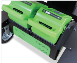
Swappable lithium battery system