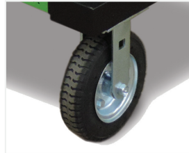
8” rugged casters