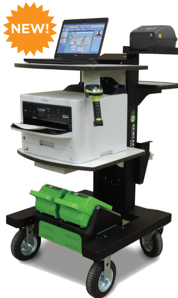
FH Series with PowerSwap Nucleus® CLASSIC Power System

Print, Test, Scan and Maneuver with the FH Series www.newcastlesys.com/fhseries